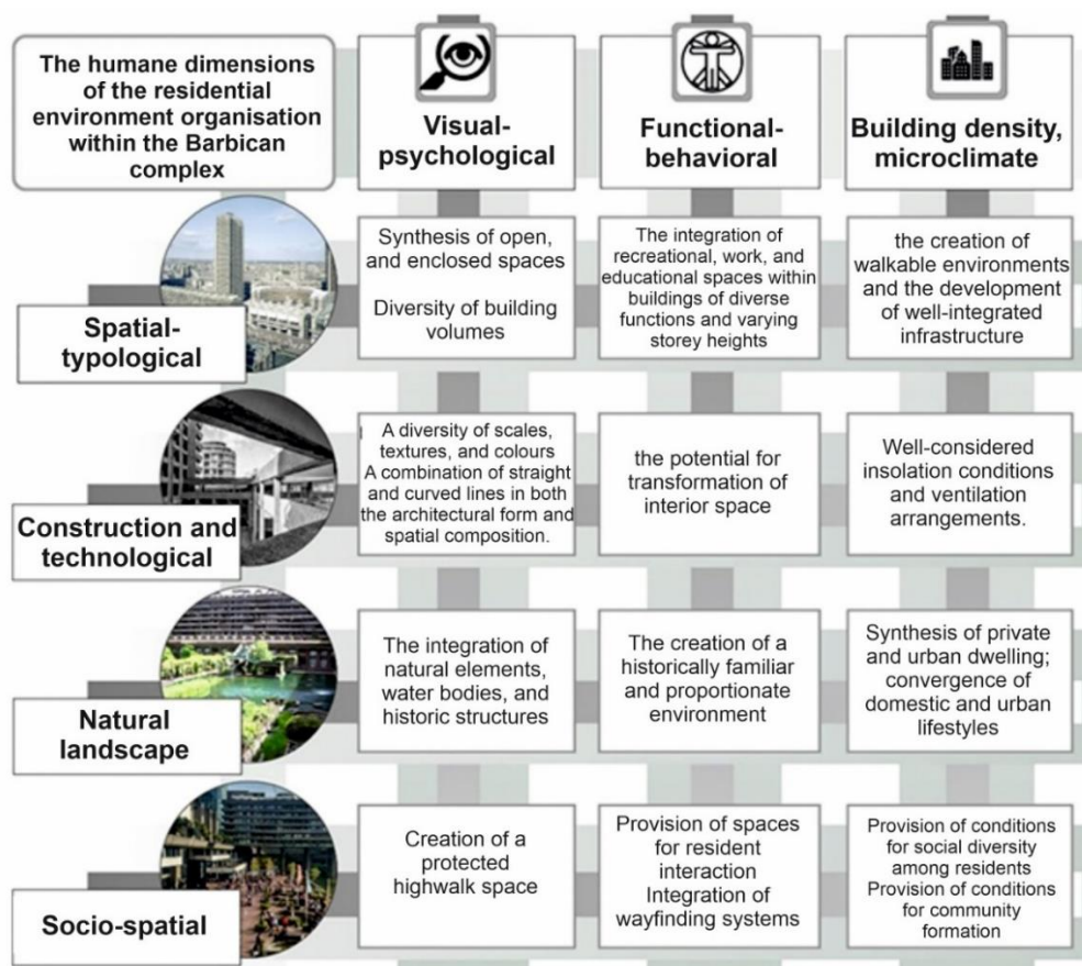
Figure 3 – The Humanitarian aspects of organizing the residential environment of the Barbican Complex (author’s material)

It is worth noting that the architects’ approach to the design and spatial organisation of the residential complex was based not solely on housing as a material expression, but also took into account the visual and psychological aspects of human perception. This resulted in an integrated living environment that is equally comfortable for people of varying income levels, occupations, family structures, and ages. The complex today stands as evidence that, with well-considered residential planning, it is possible to create comfortable living conditions while simultaneously achieving high-density development.