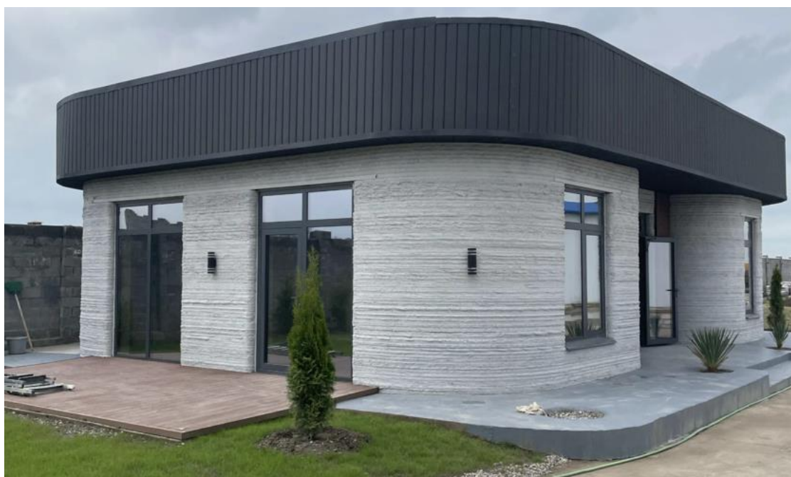
Figure 4 – The first residential building in Central Asia constructed with a COBOD BOD2 3D printer. Architect/Builder: BM Partners 3D Print (authors' material).

The Angolan experience demonstrates the potential of adaptive construction at the scale of mass housing, highlighting its relevance not only in high-tech contexts but also for social architecture. Such cases can be instructive when assessing the feasibility of implementing similar approaches in Kazakhstan's architectural practice, taking into account the country's climatic and infrastructural realities. BM Partners 3D Print executed the first residential building in Central Asia constructed with a COBOD BOD2 3D printer ( Figure 4 ). The project was adapted to seismic conditions of up to 7 on the Richter scale. The overall construction process took less than two months, while the wall printing itself lasted only five days. The company is also developing proprietary mix formulations that account for local climatic specifics.