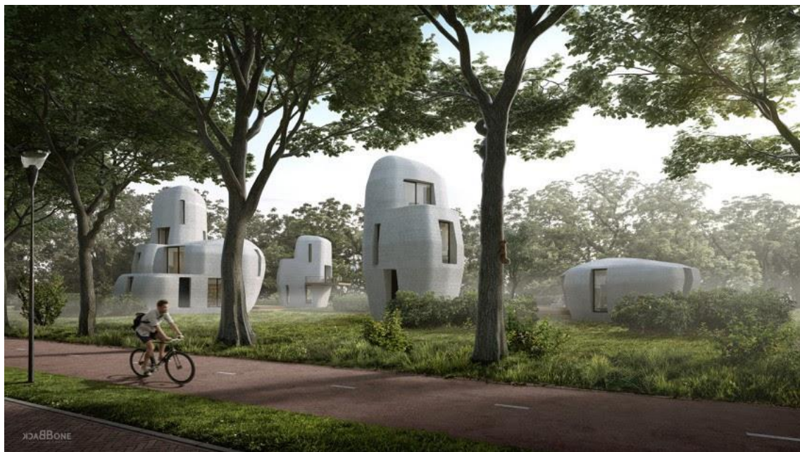
Figure 1 - The world's first residential project constructed from 3D-printed concrete, Eindhoven, Netherlands. Architects: Houben & Van Mierlo Architecten ( Souza, 2021 ).

The Milestone project became the world's first commercial 3D-printed residential development ( Figure 1 ). It comprises five houses, each printed layer by layer from a concrete mix, with the final house intended to be fully assembled on site. The homes exhibit high energy efficiency, complex geometries and an aesthetic that would be impossible to achieve with conventional construction. Thanks to digital control of the construction process and optimized material use, the project achieved a significant reduction in its carbon footprint ( Souza, 2021; Walsh, 2018 ).